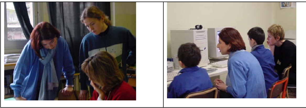
Figure 2. Aspects of the joint work teachers-researchers during experiments: sharing decisions and monitoring students

The enactment phase, the one where children played the games, fully demanded both teachers and researchers to play a significant role: to follow the students during the gaming sessions (Fig.2), together with the teachers and the special needs educators: this allowed a multifaceted monitoring of the situation, revising the fine tuning, amending and improving the monitoring and evaluation sheets that had been "ad hoc" produced to allow data retrieval and analysis.