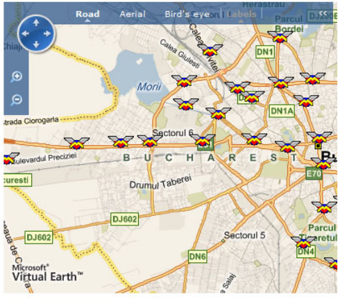
Figure 1.1 Microsoft Bing Maps Web GIS

Currently, Mobile GIS applications are becoming increasingly popular [DOYL10]. Figure 1.2 shows the use of Google Maps in the mobile version of the developed system. MoTripAssistent uses Google Maps API [GOOG11d] to represent spatial information across different mobile platforms.