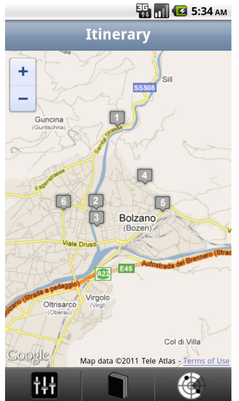
Figure 1.2 Google Maps on a mobile device

Currently, Mobile GIS applications are becoming increasingly popular [DOYL10]. Figure 1.2 shows the use of Google Maps in the mobile version of the developed system. MoTripAssistent uses Google Maps API [GOOG11d] to represent spatial information across different mobile platforms.