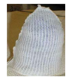
Figure 3. Textile implants