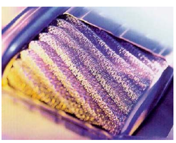
Figure 5. Catalytic elements