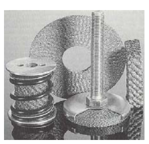
Figure 6. Damping elements