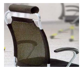
Figure 4. Upholstery fabrics