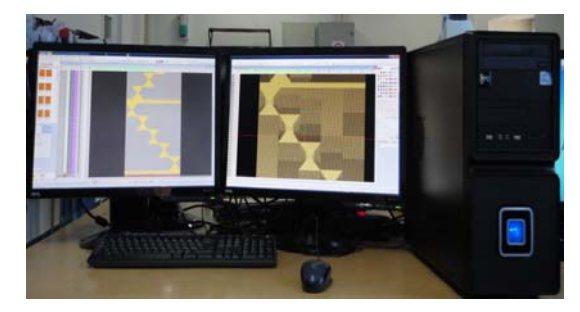
Figure 7. M1 plus software solution

Computer Aided Design is a preparatory stage of the patterns, aimed to design the knitting programs in a specific language, readable by the machine. This activity is accomplished today with the help of IT equipment, based on electronic data processing [5]. Generally, the heart of such an equipment is a personal pc, with keyboard, one or two monitors and data storage unit. The world leaders in knitting machine builders have been developed advanced and high specialized software, according to the type of knitting technology. One example is the M1 plus software solution, provided by Stoll Company, designed with two monitors (figure 7), in order to facilitate the two views of the fabric to the users. Technical View contains technical details about machine settings (figure 8) and Fabric View offers a simulation of the real fabric (figure 9).