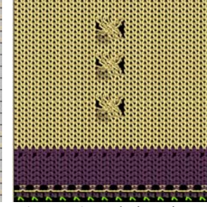
Figure 8. Technical View window of the fabric